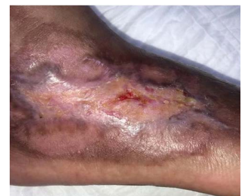
6 weeks post treatment