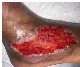
4 weeks post treatment