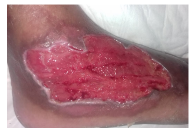
2 weeks post treatment